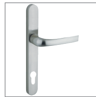
Smooth Satin Chrome